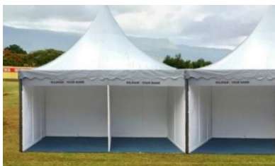
Shell scheme partitions from CES “Conferences & Exhibitions” Services – Dar es Salaam (see picture):